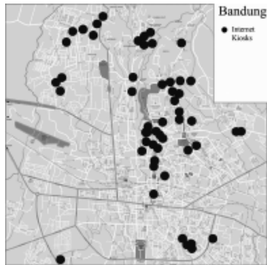
Figure 3. Internet Kiosks in Bandung