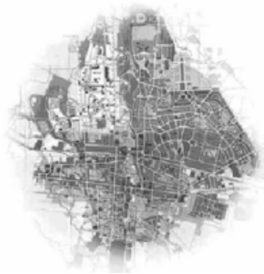
Figure 1. Map of Bandung

chose a site south of this road on the western bank of the Cikapundung. On this site, he built his palace and the city square ( alun-alun ). Following traditional orientations, the Grand Mosque was placed on its western side, the public market on the East, with the Regent's residence and meeting place ( pendopo ) on the South facing Mount Tangkuban Perahu. Thus, the origins of Bandung began. (1)