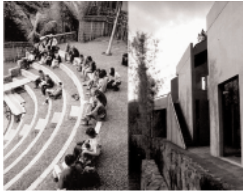
Figure 5. Selasar Sunaryo Art Space: more than just an art gallery